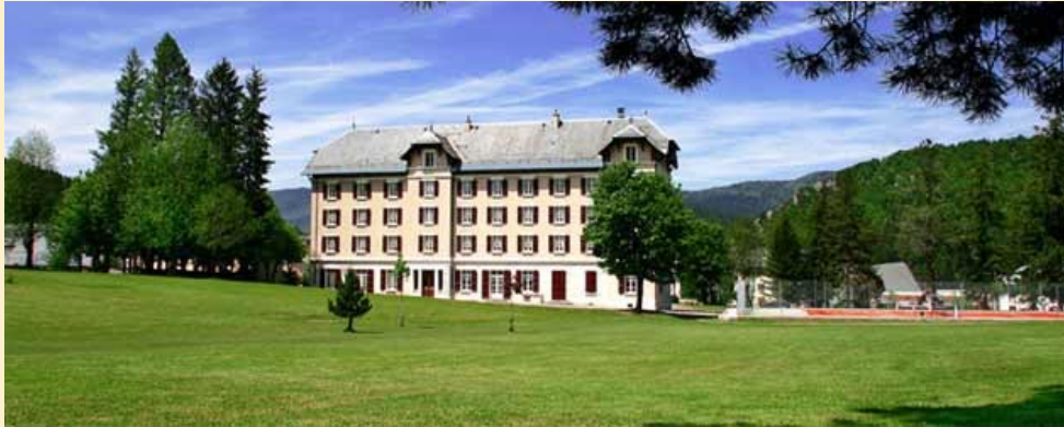
Le Grand Hôtel de Paris - Villard De Lans

Tel: +33 (0) 4 76 95 10 06 - Fax: +33 (0) 4 76 95 10 02.